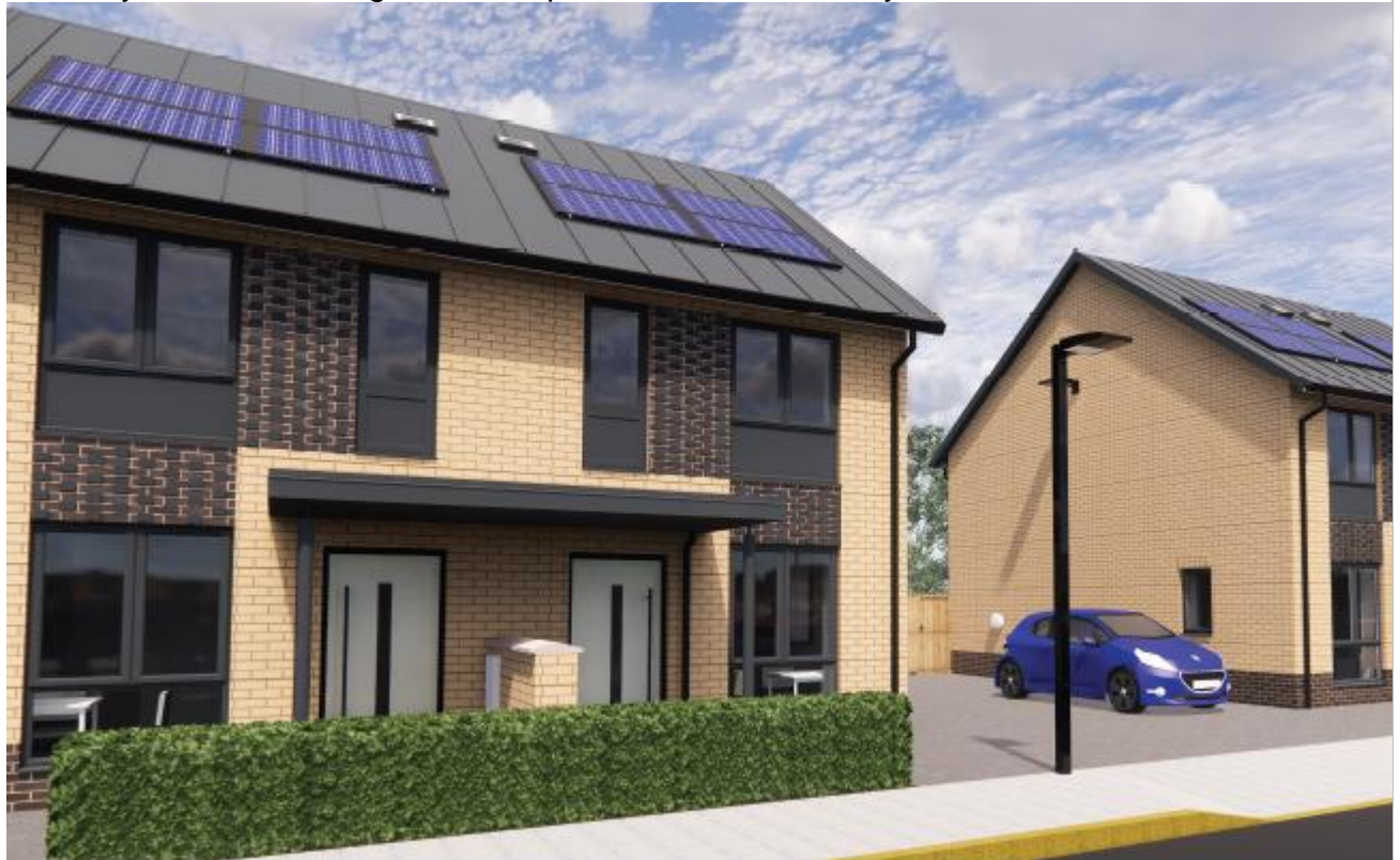
Image of proposed street scene

Saffron Lane was tendered, and the contract awarded to Robert Woodhead Construction, unfortunately they went into voluntary liquidation soon after starting on site. We are currently out to tender again and hope to be on site in early 2024.